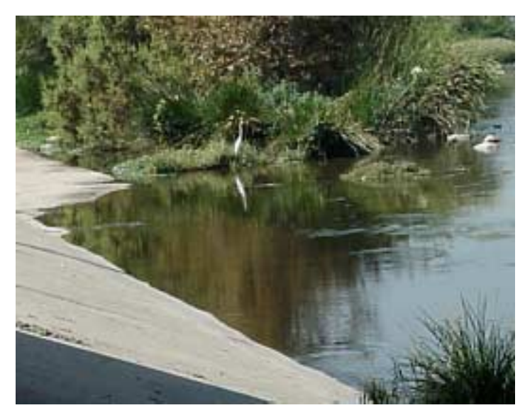
Figure B. Fletcher Drive: Great Egret, October 26, 1999.

From Figueroa Street to Washington Boulevard, the river supports several beneficial uses, including the Downtown Channel, which is used by many for recreation and bathing, in particular by homeless people who seek shelter there.